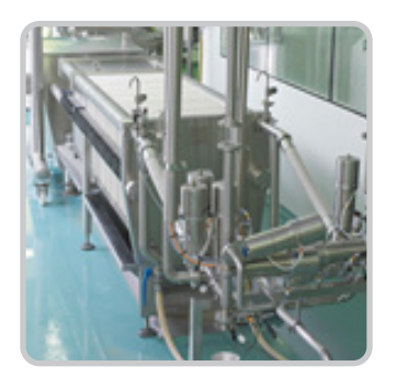
PLATE & FRAME FILTER SYSTEMS AND FILTER SHEETS

The filter sheets, with or without filter aids such as DE and perlites, provide high dirt holding capacity and wide range of filtration ratings from coarse pre-filtration up to fine filtration towards the end of the process.